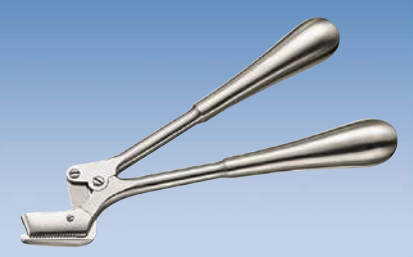
Stille cast shear, 26 cm ref. MP-1997