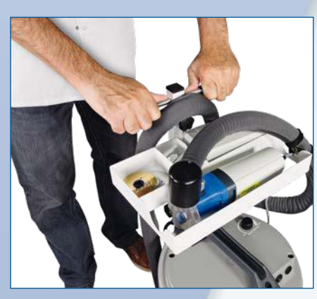
Storage compartment. Handles make it easy to move.

OSCIMED vacuum cleaner with European plug: ref. OSC 206-V90 OSCIMED vacuum cleaner with British plug: ref. OSC 206-V90-UK OSCIMED 120 V/60 Hz vacuum cleaner with U.S. plug: ref. OSC 206-V90-US