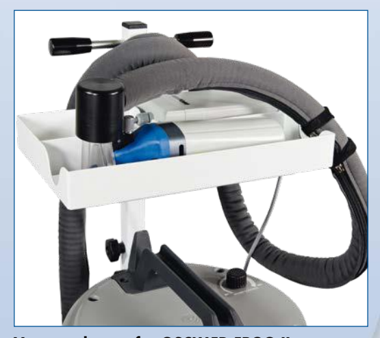
Vacuum cleaner for OSCIMED ERGO II and OSCIMED 2000

OSCIMED vacuum cleaner with European plug: ref. OSC 206-V90 OSCIMED vacuum cleaner with British plug: ref. OSC 206-V90-UK OSCIMED 120 V/60 Hz vacuum cleaner with U.S. plug: ref. OSC 206-V90-US