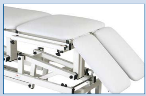
ref. TP 01

The table is always equipped with castors and with a central locking which allows the castors to brake simultaneously. Very high quality upholstery with padding thickness of +/- 55 mm