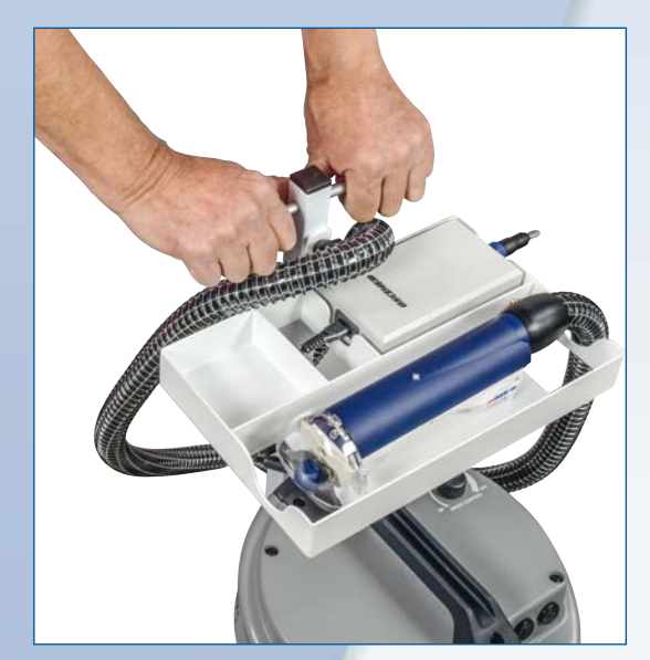
Storage compartment. Handles make it easy to move.