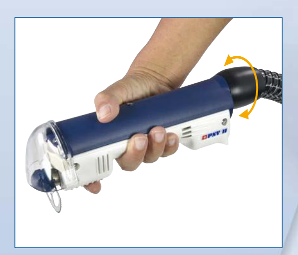
The saw and the vacuum hose can rotate independently. No electric cable attached to the hose or laying on the floor.